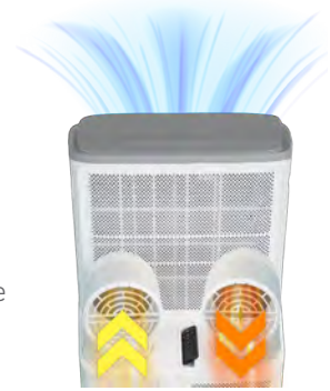
OUTSIDE AIR HEAT REMOVED FROM ROOM

DUAL-HOSE DESIGN: Dedicated intake & exhaust hoses balance air circulation, expelling hot air outdoors, and keeping cooled, conditioned air inside resulting in up to 40% faster cooling.