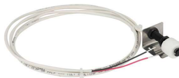
Condensate Overflow Switch #SS3