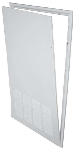
Optional wall panel (Recessed wall application)