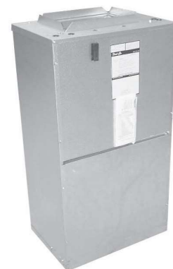
Unit shown with optional bottom return air kit (#90PK4 or #90PK5)